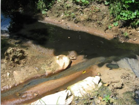
July 10 th , black water, bubbling with gas