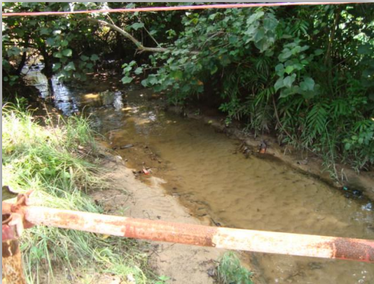
Sept. 17 th , water is clear, pollution and nuisances are stopped.

Thailand: a high-end island resort leverages NeoBio Septic's swift action to depollute black water in worker camps.